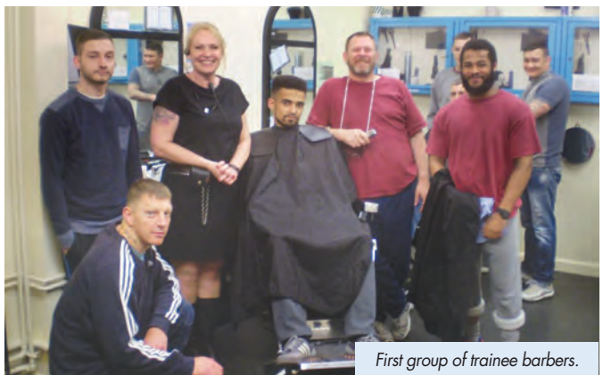
First group of trainee barbers.

The shop fulfilled two purposes. The obvious one being that, with some 550 inmates, it provided a necessary service and, as importantly, it allowed prisoners formally to train as competent barbers and emerge with NVQ qualifications at the end of the 11 week course. FOGM, with their on-going desire to see men leave