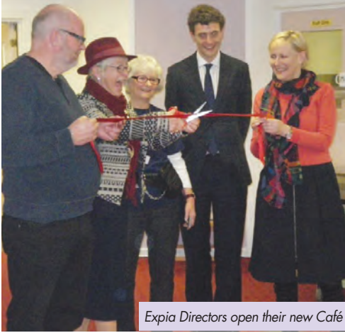
Expia Directors open their new Café