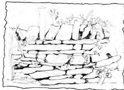
When the wind rises some people build walls others build windmills