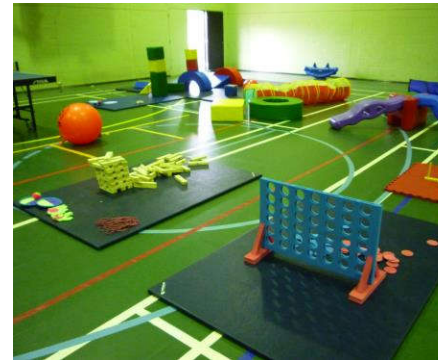
Some of the large floor games

The Mothers Union operate a cafeteria in the Salisbury Law Courts for the convenience of all users of the courts whichever side of the law they represent. Despite the café being run solely by volunteers a degree of profit is inevitable. They wish some of their profits to be directed into the criminal justice system and selected the two local prisons of Dorset and Wiltshire as benefactors. FOGM was delighted to research the best use of these funds with the result that we have organised a considerable number of large games for use during all future Family Day visits.