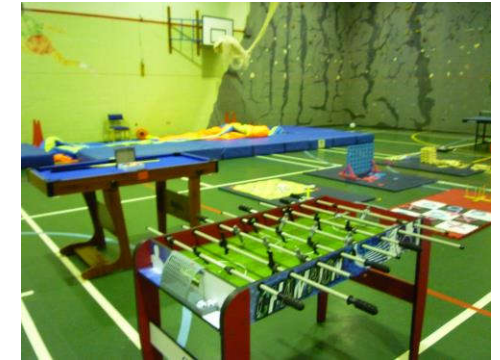
Football table, one of the table games

These were added to the limited equipment supplied by the prison which turns the Sports Hall into a most exciting area for children to experience fun time with their mother and father; a rare treat through no fault of their own. We show some photos of the Hall prepared for the visit in May.