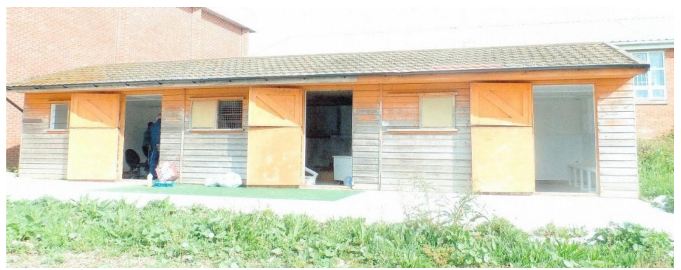
One of our FOGM committee members went one better and has now also introduced North Dorset Rugby Club to the Prison Officer and as we speak, the grass is growing and North Dorset Rugby Club are talking about how all parties can now work together.

So, I hear you ask, where do FOGM appear? Well, to the side of the intended playing area were some very old and dilapidated horse stables. Drawing up another plan for funding, the PO presented the FOGM committee with a well-costed and researched request for the goods he needed to turn the run-down stables into home and away changing rooms. We used our contacts in the building industry to secure all the items he wanted - and at a more competitive price. So, a win-win for his project and FOGM.